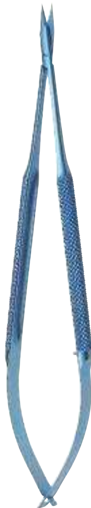
Schere gerade Scissors straight 251/31T [ 150mm 251/32T [ 180mm