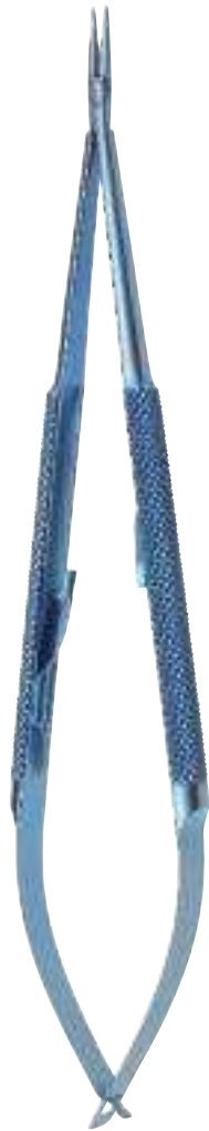
Nadelhalter gerade Needle holder straight 174/80T [ 150mm 174/81T [ 180mm